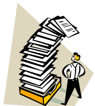
figure out what benefits they are entitled to and tell them what they must do to receive them.

Elderly benefit specialists receive ongoing training and are monitored by attorneys knowledgeable